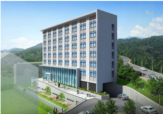
<Anam Global House>