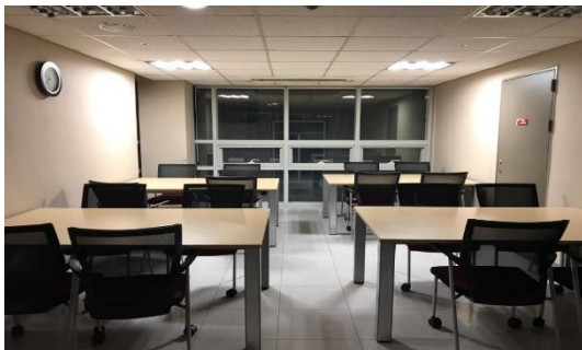
<Anam Global House study room>