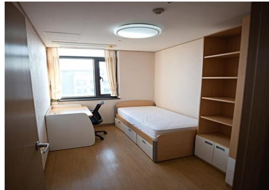
<Anam Global House room>