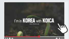
<KOICA SP Introduction Video>